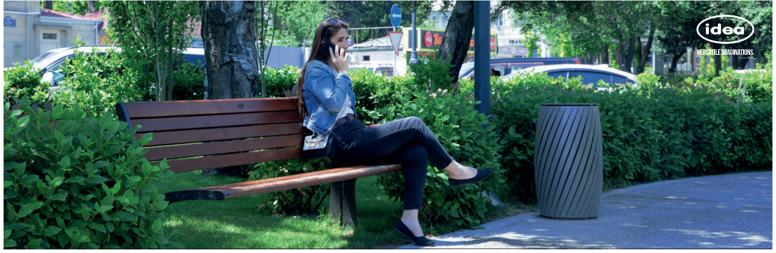
DIMENSIONS: L1860xW550xH430/810 mm